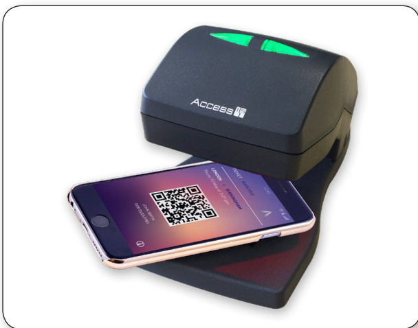
The LSR120 CBC can also read barcodes presented on smartphones, tablets and other electronic devices.

Ruggedly constructed, with no moving parts, these devices are built to withstand years of frontline use.