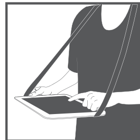
Working in standing up position