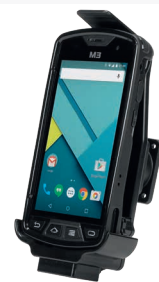
Vehicle support (Brodit)