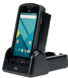
Docking station HDMI/ Ethernet