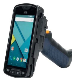
Pistol Grip (Trigger)