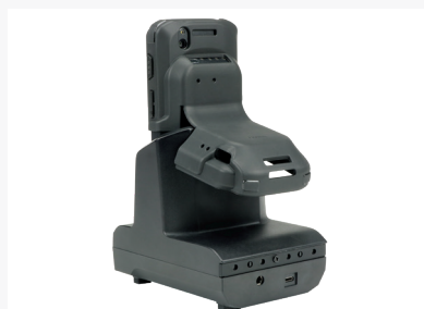
Base single slot cradle (CRD-TC2X-BS1CO-01)