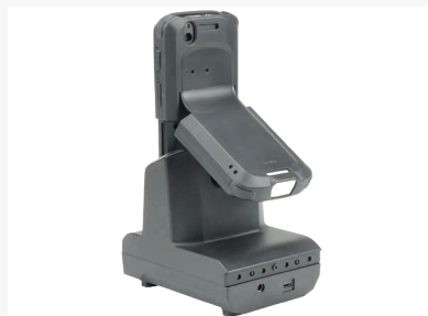
Base single slot cradle (CRD-TC2X-BS1CO-01)