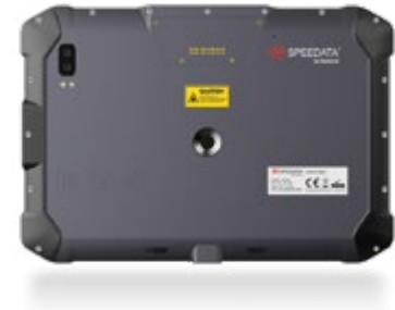
backside of the SD100