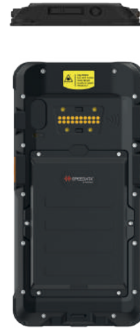
backside of the FG60 Neptune